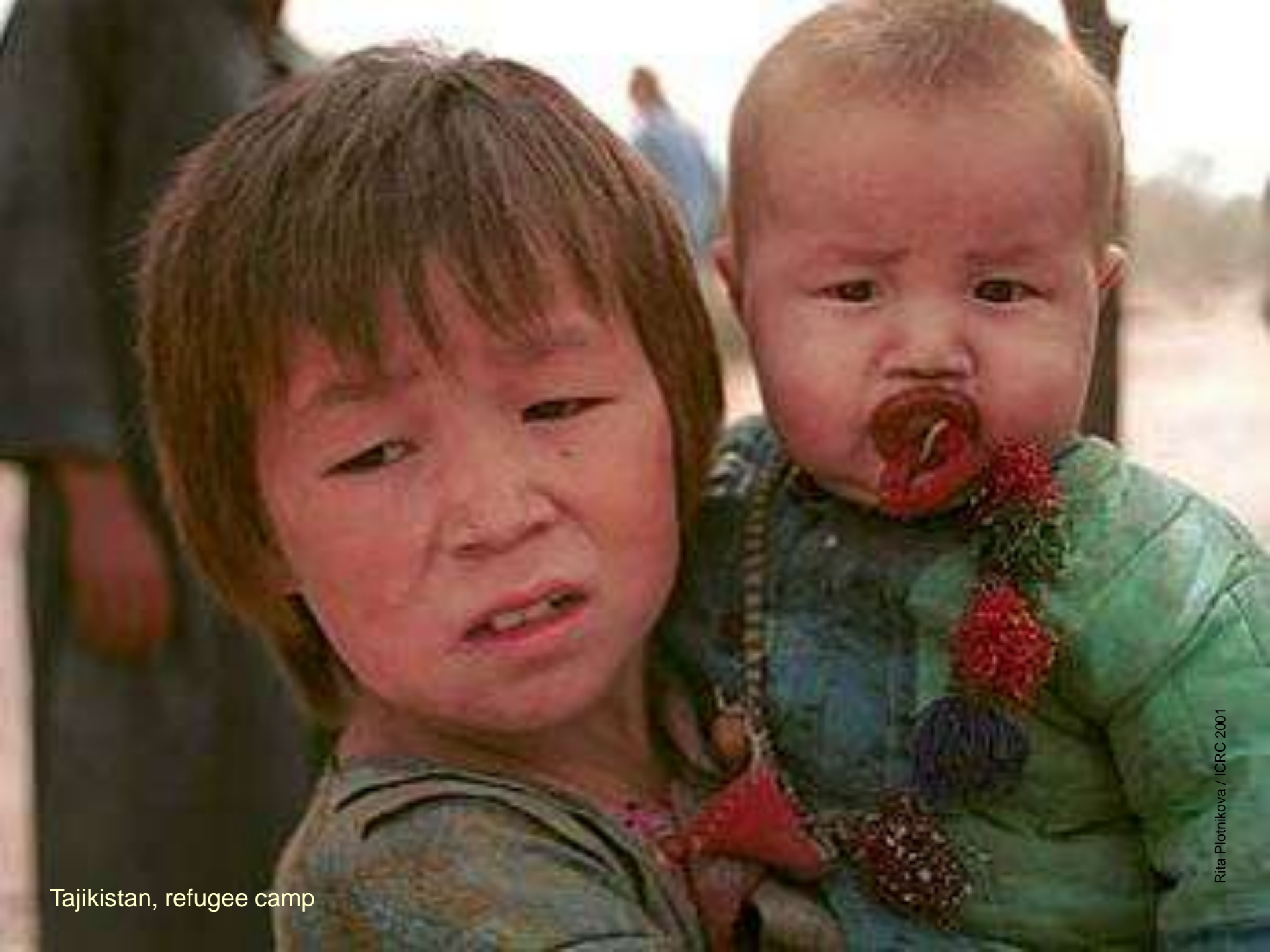
Tajikistan, refugee camp