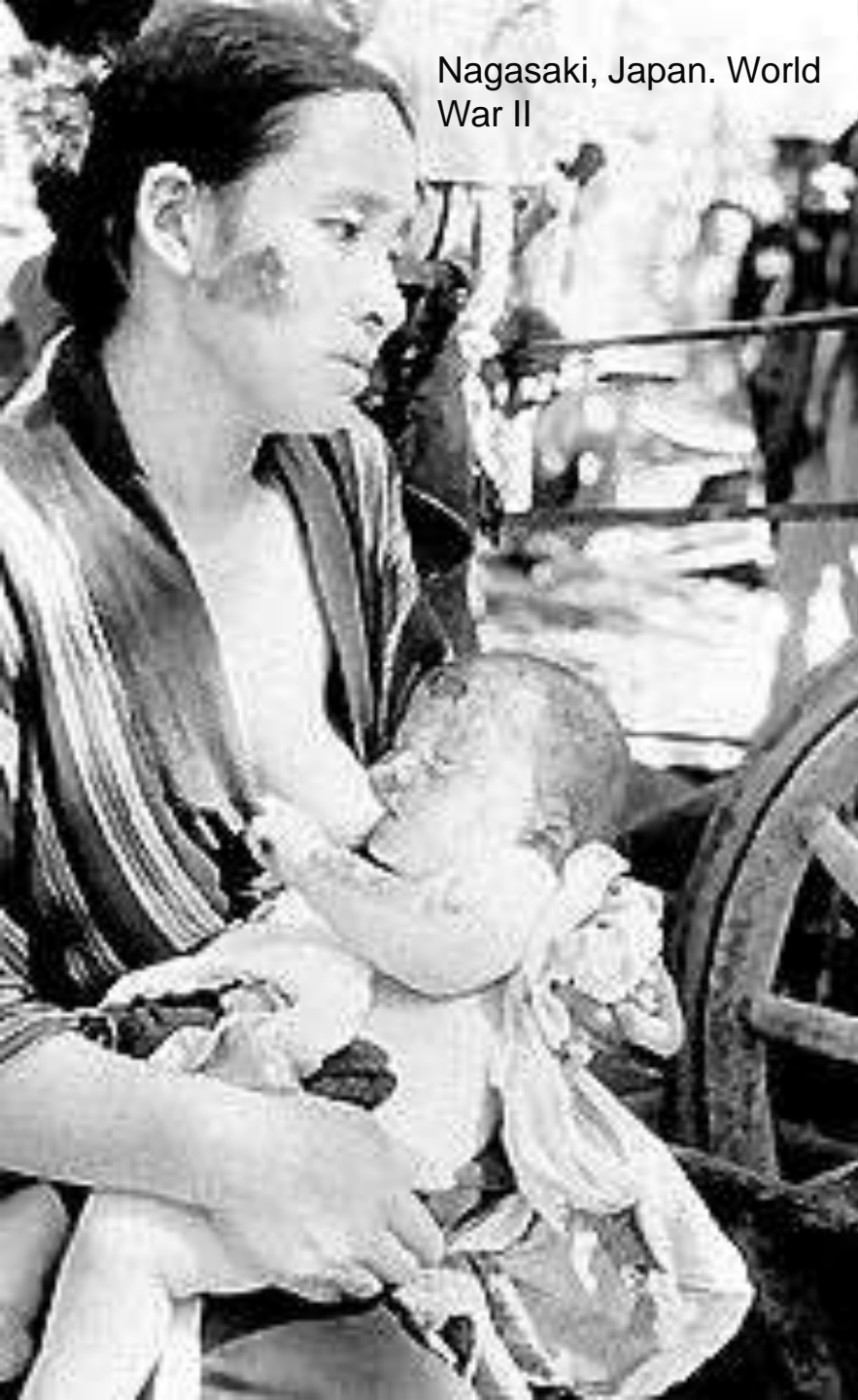
Nagasaki, Japan. World War II