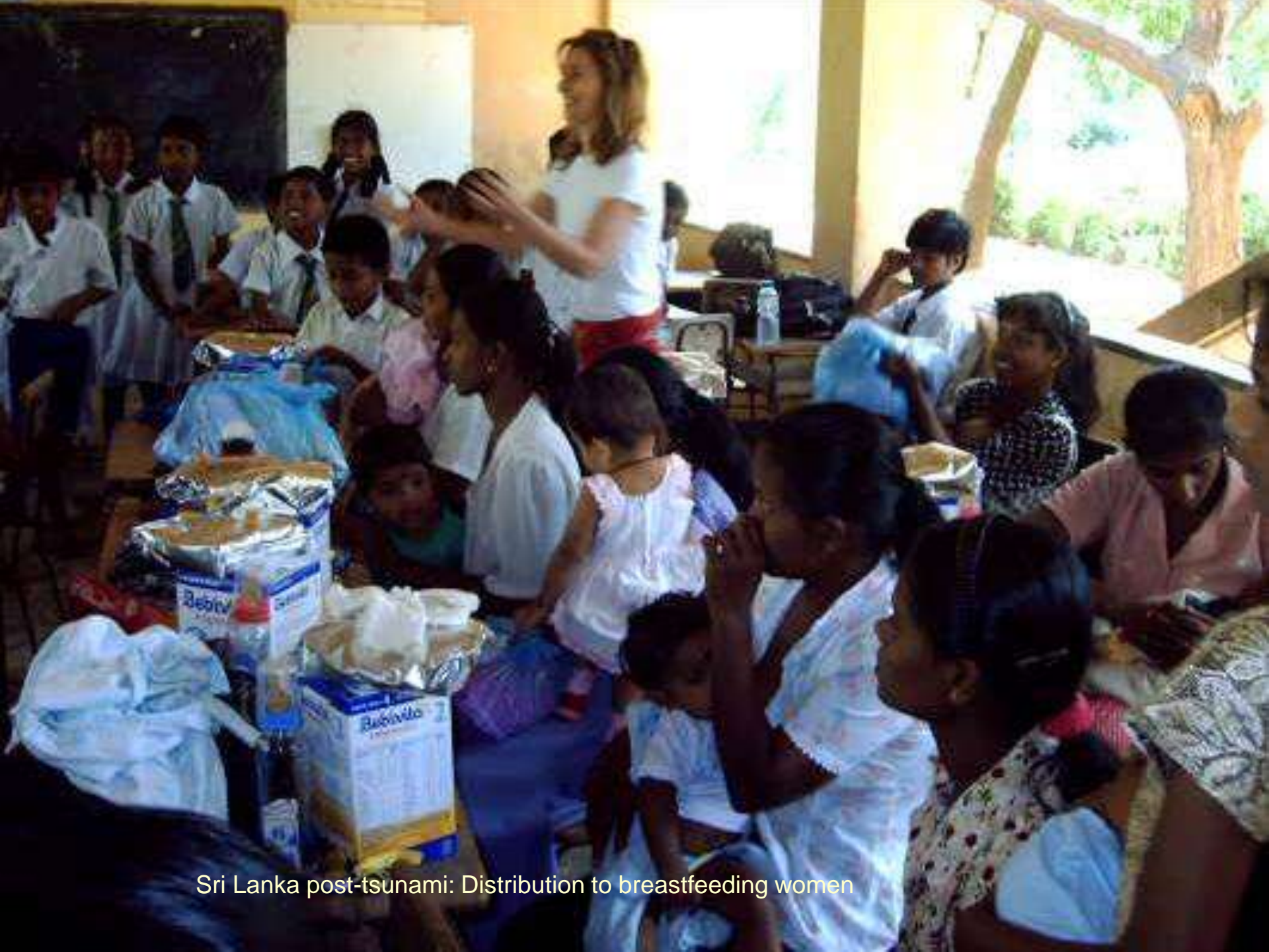
Sri Lanka post-tsunami: Distribution to breastfeeding women