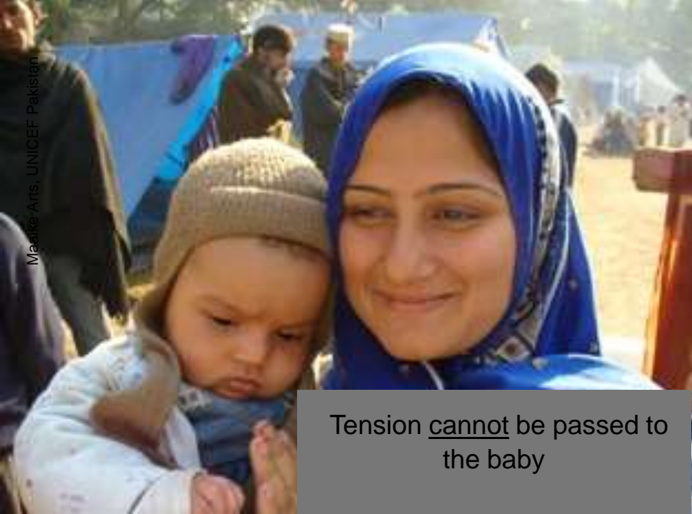
Mothers are strong