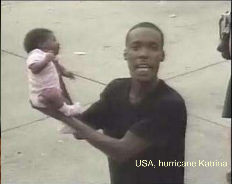
USA, hurricane Katrina