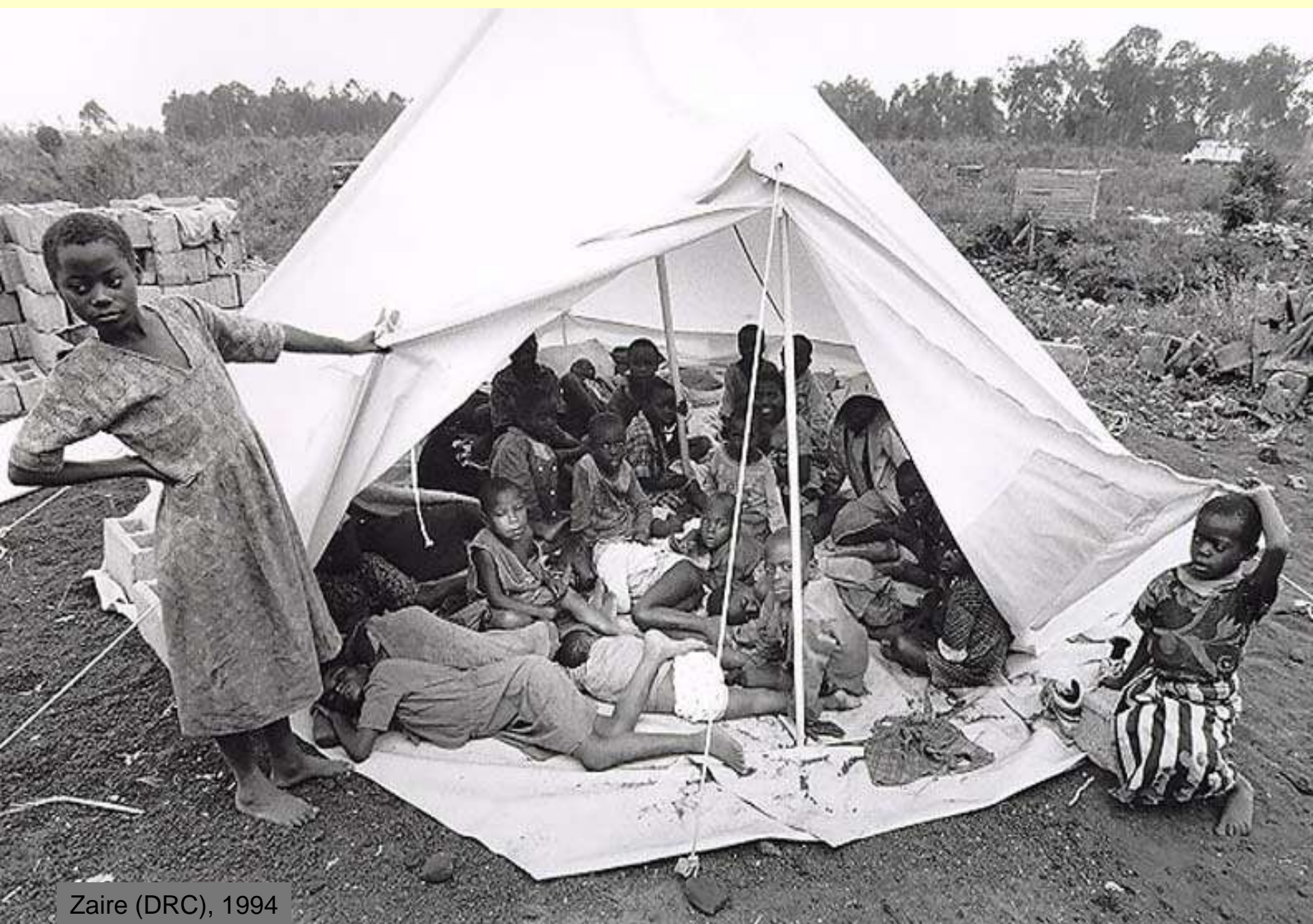
Zaire (DRC), 1994