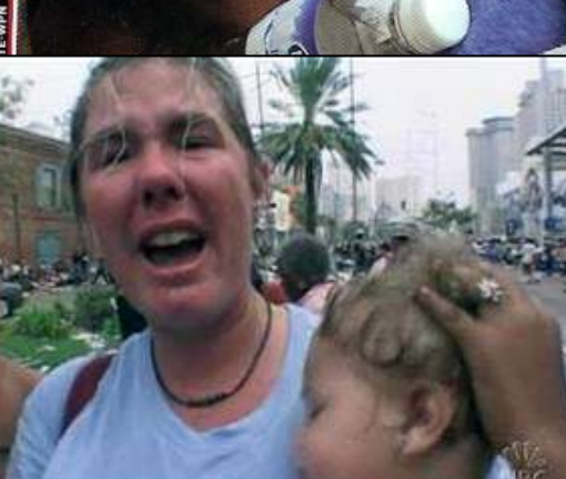
A Katrina refugee and her two children, New Orleans, Sept. 1, 2005