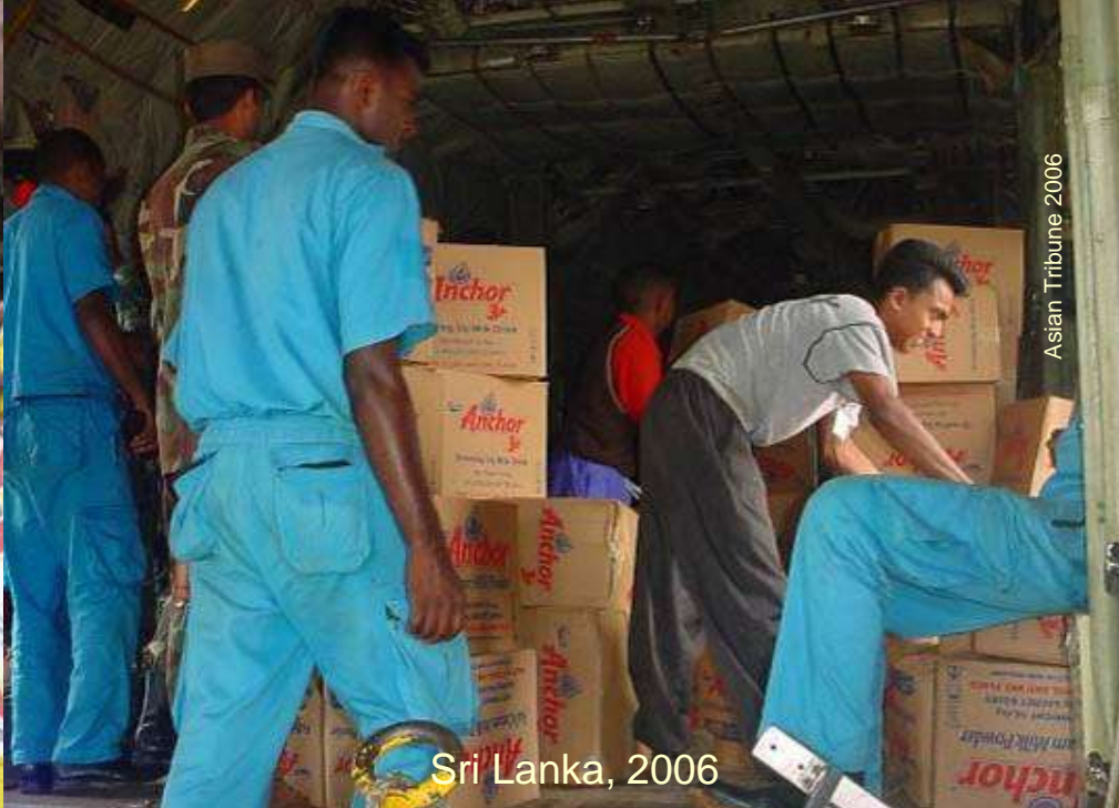
Sri Lanka, 2006