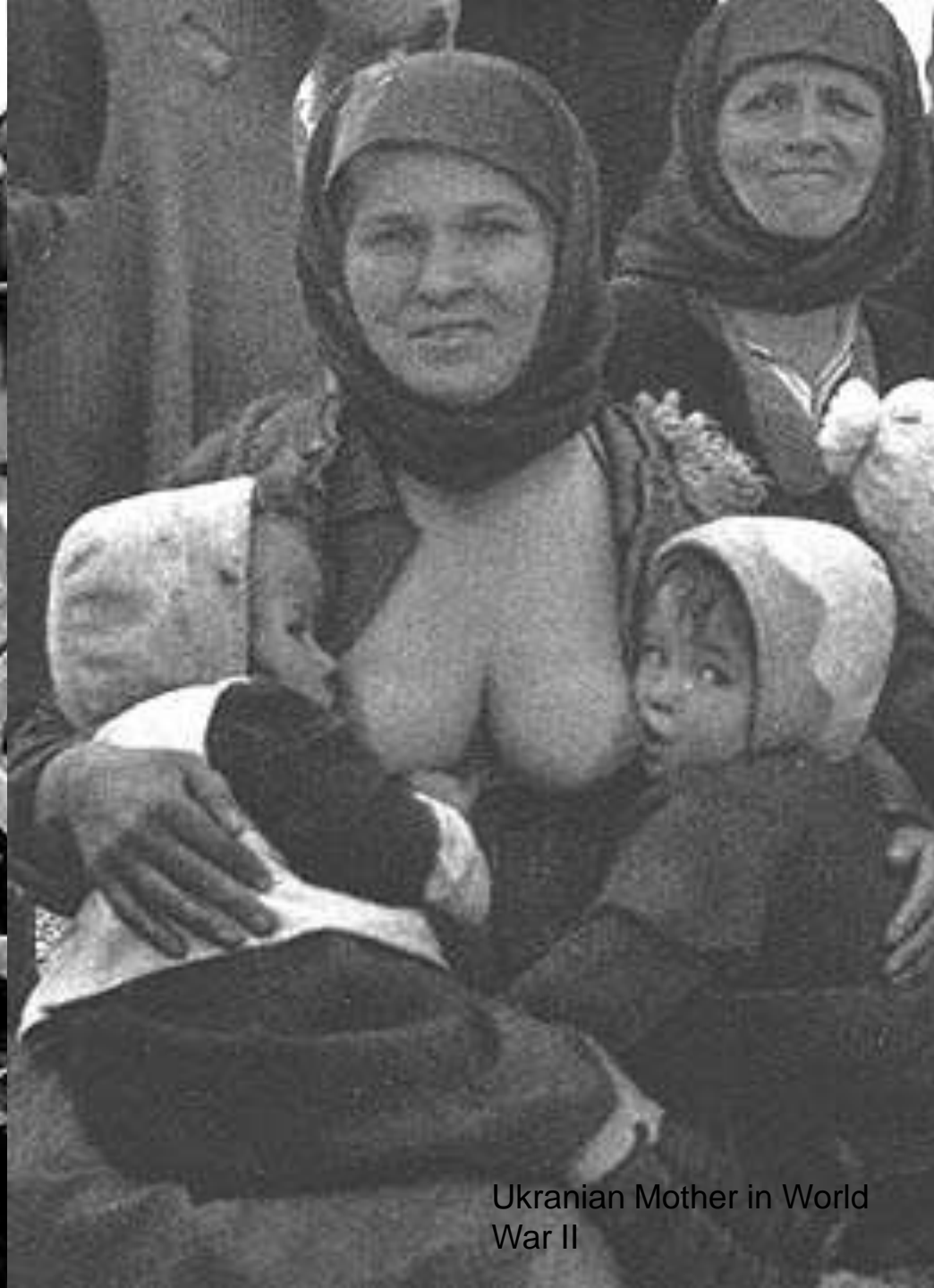
Ukrainian Mother in World War II