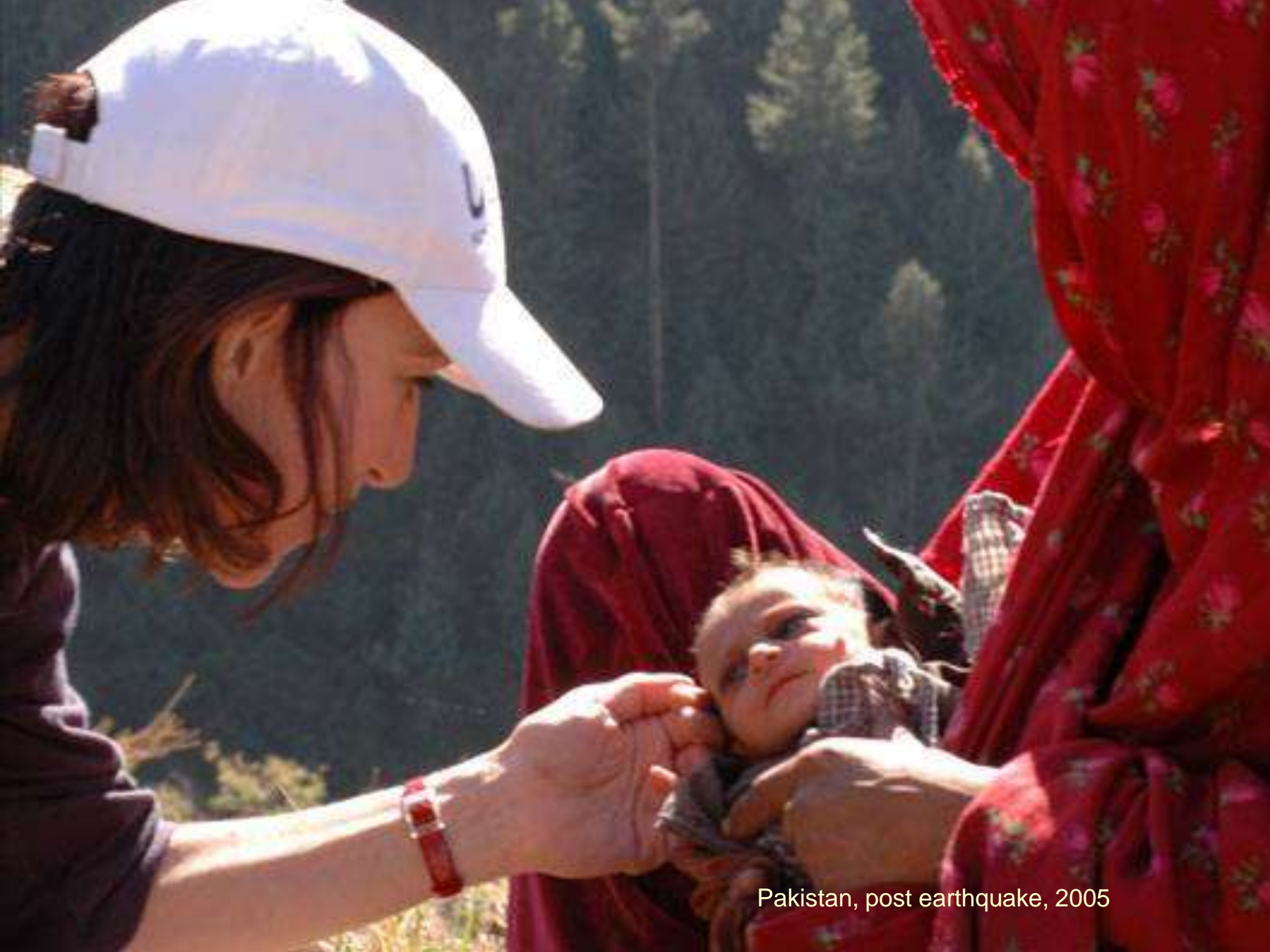
Pakistan, post earthquake, 2005