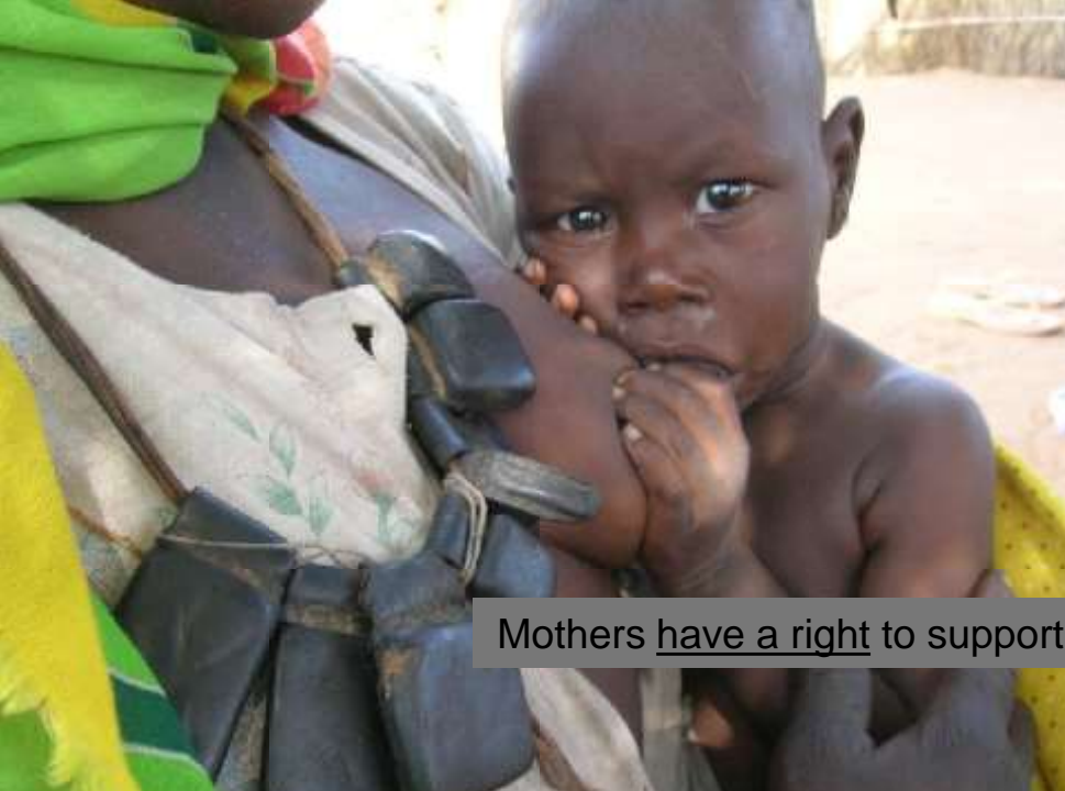
Mothers have a right to support