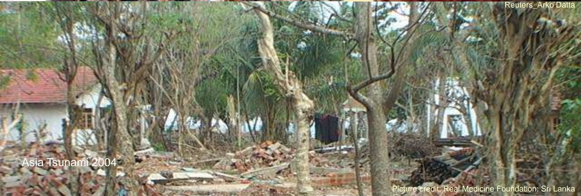
Asia Tsunami 2004