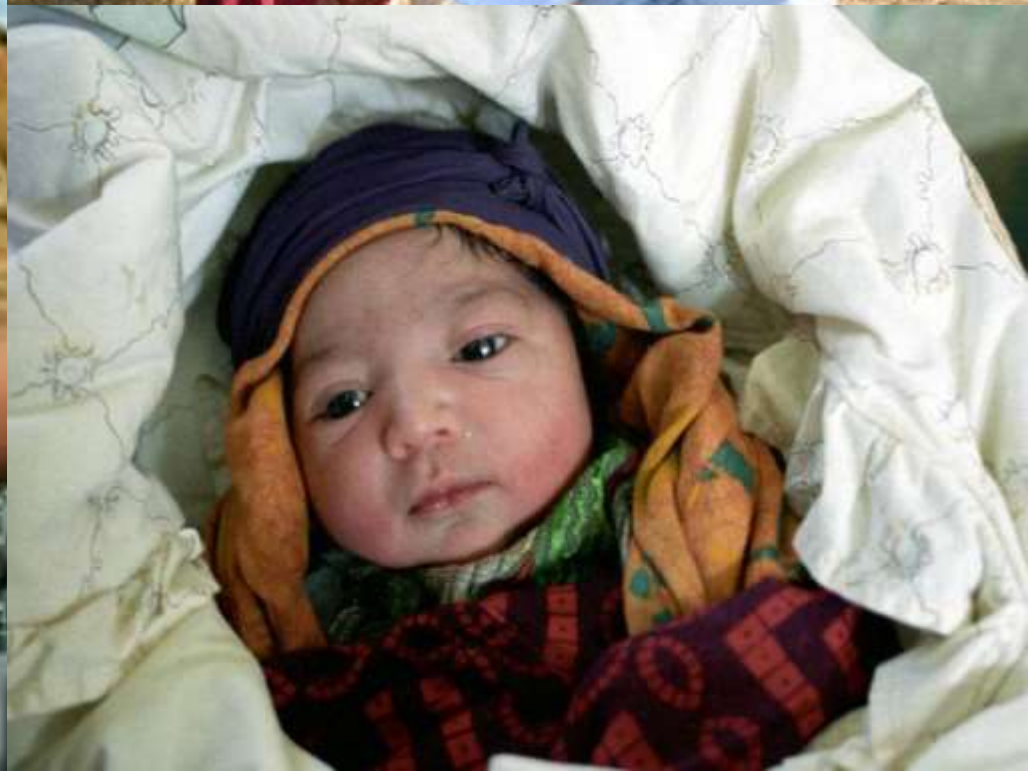
Pakistan post earthquake, 2005