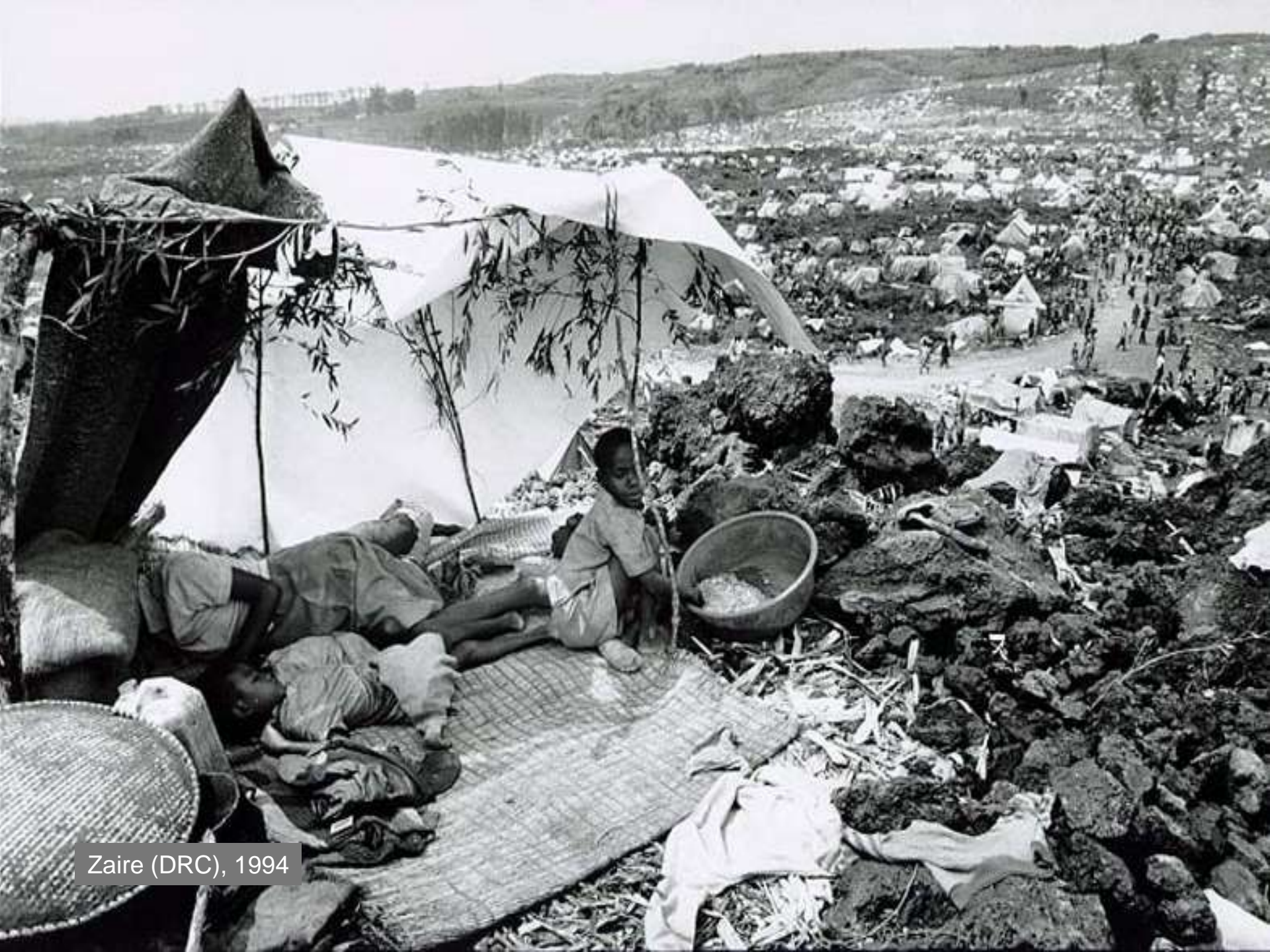
Zaire (DRC), 1994