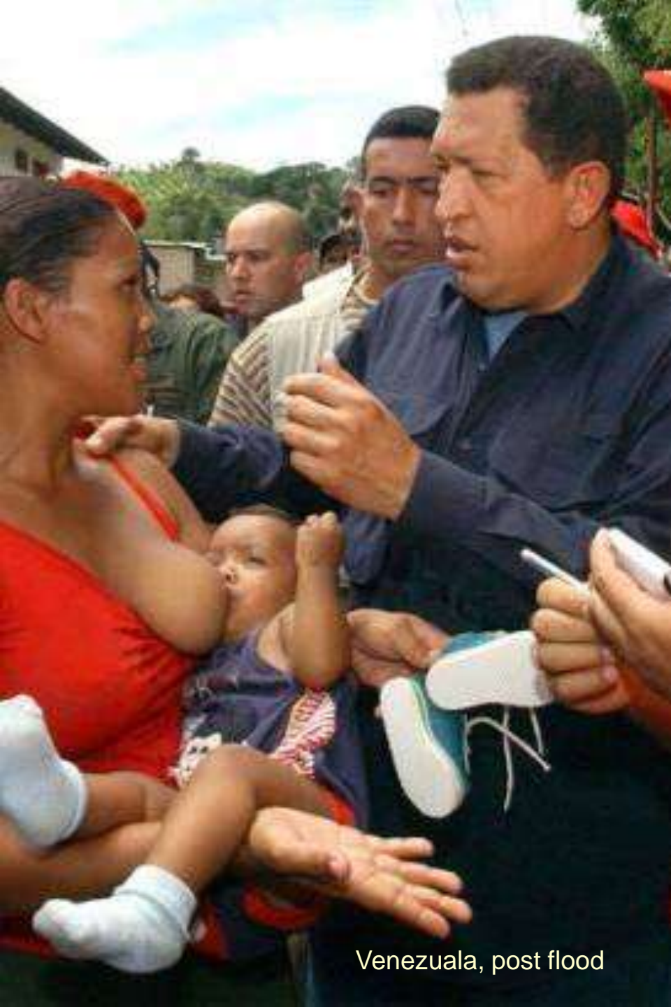
Venezuela, post flood