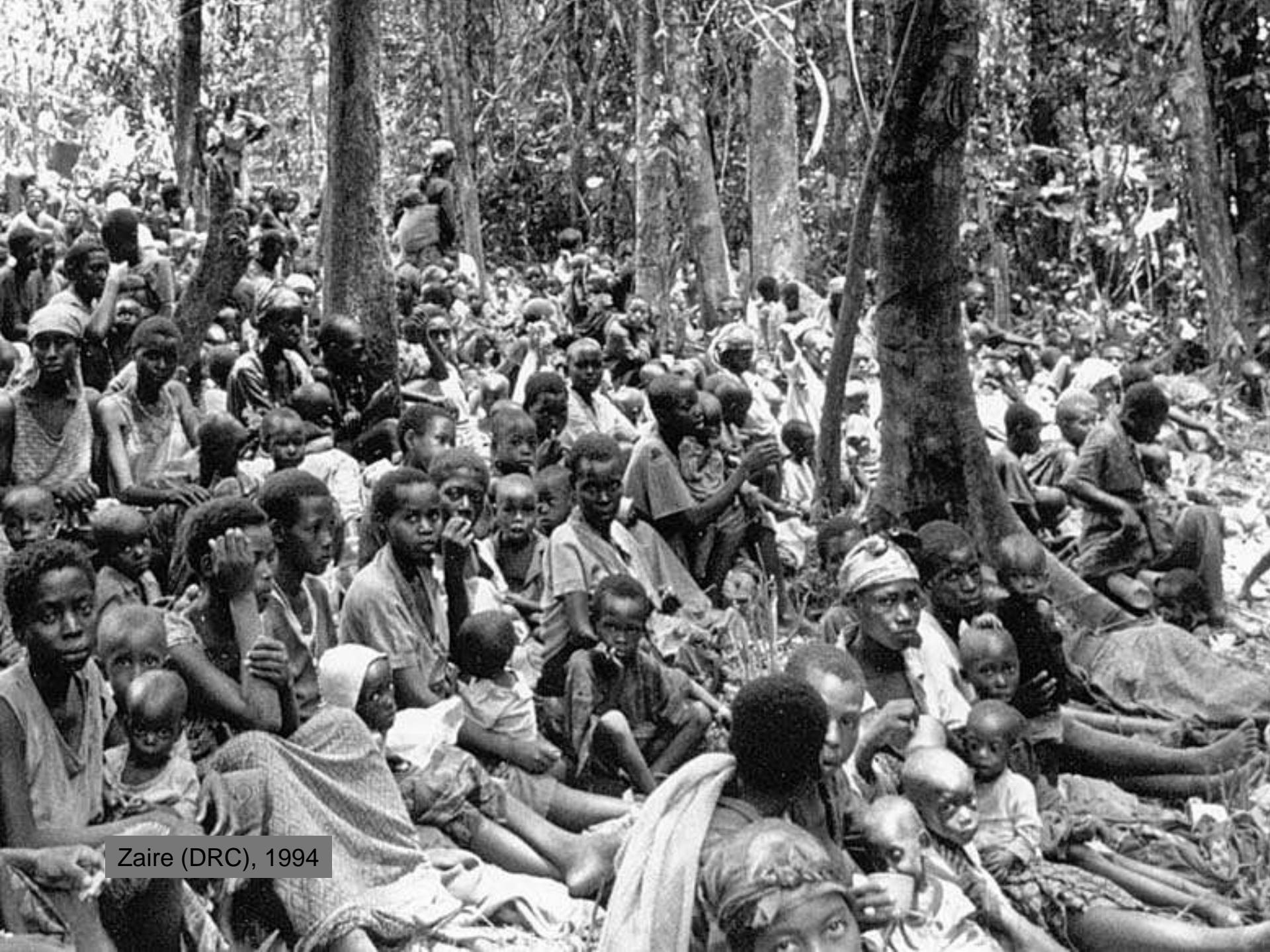
Zaire (DRC), 1994