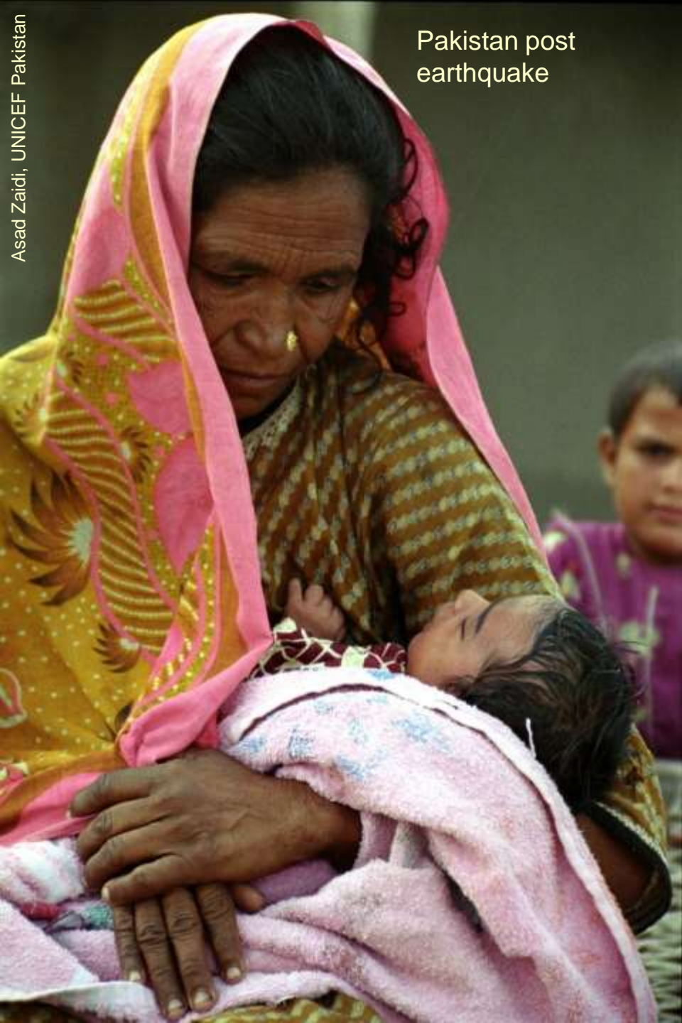
Pakistan post earthquake