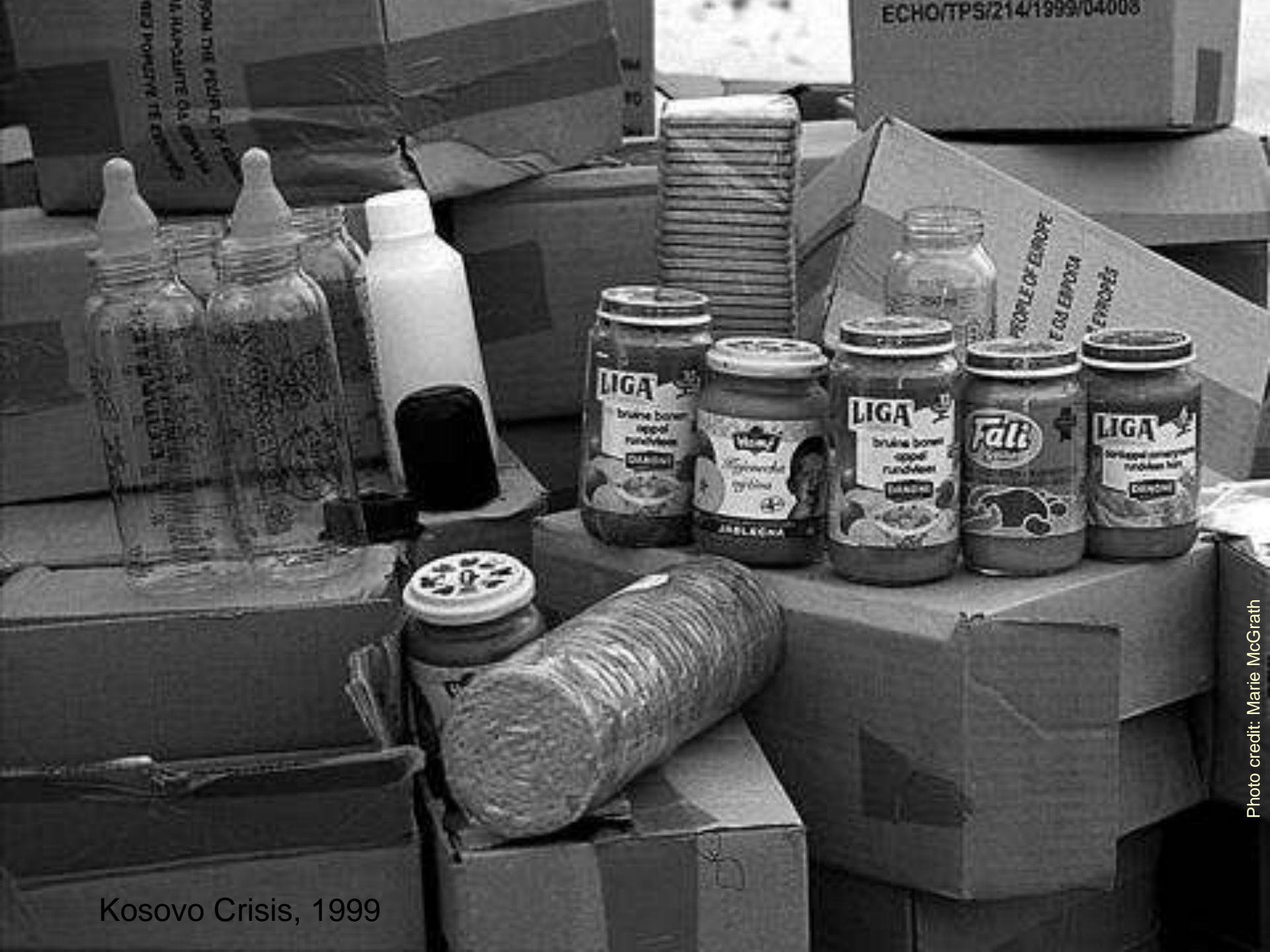
Kosovo Crisis, 1999