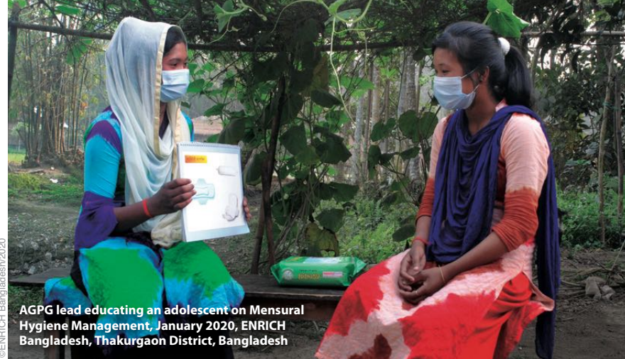
AGPG lead educating an adolescent on Mensural Hygiene Management, January 2020, ENRICH Bangladesh, Thakurgaon District, Bangladesh

The project experienced many successes, a few challenges and some important lessons learned. One key success was the active participation and leadership of adolescent girls within the AGPGs. The co-design approach provided girls with opportunities to define group priorities and to interpret success on their terms. An additional success factor was the girls’ pre-existing feelings about the need for greater gender equality in their families and communities. For many, this desire to learn more and engage with their community for the sake of creating change was what prompted them to join the group. Future programming should expand on this by creating new opportunities for girl-led initiatives.