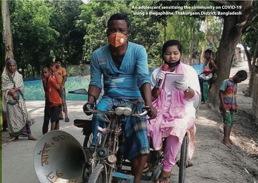
An adolescent sensitising the community on COVID-19 using a megaphone, Thakurgaon District, Bangladesh