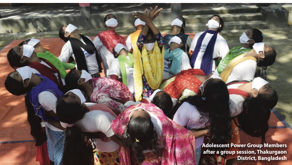
Adolescent Power Group Members after a group session, Thakurgaon District, Bangladesh