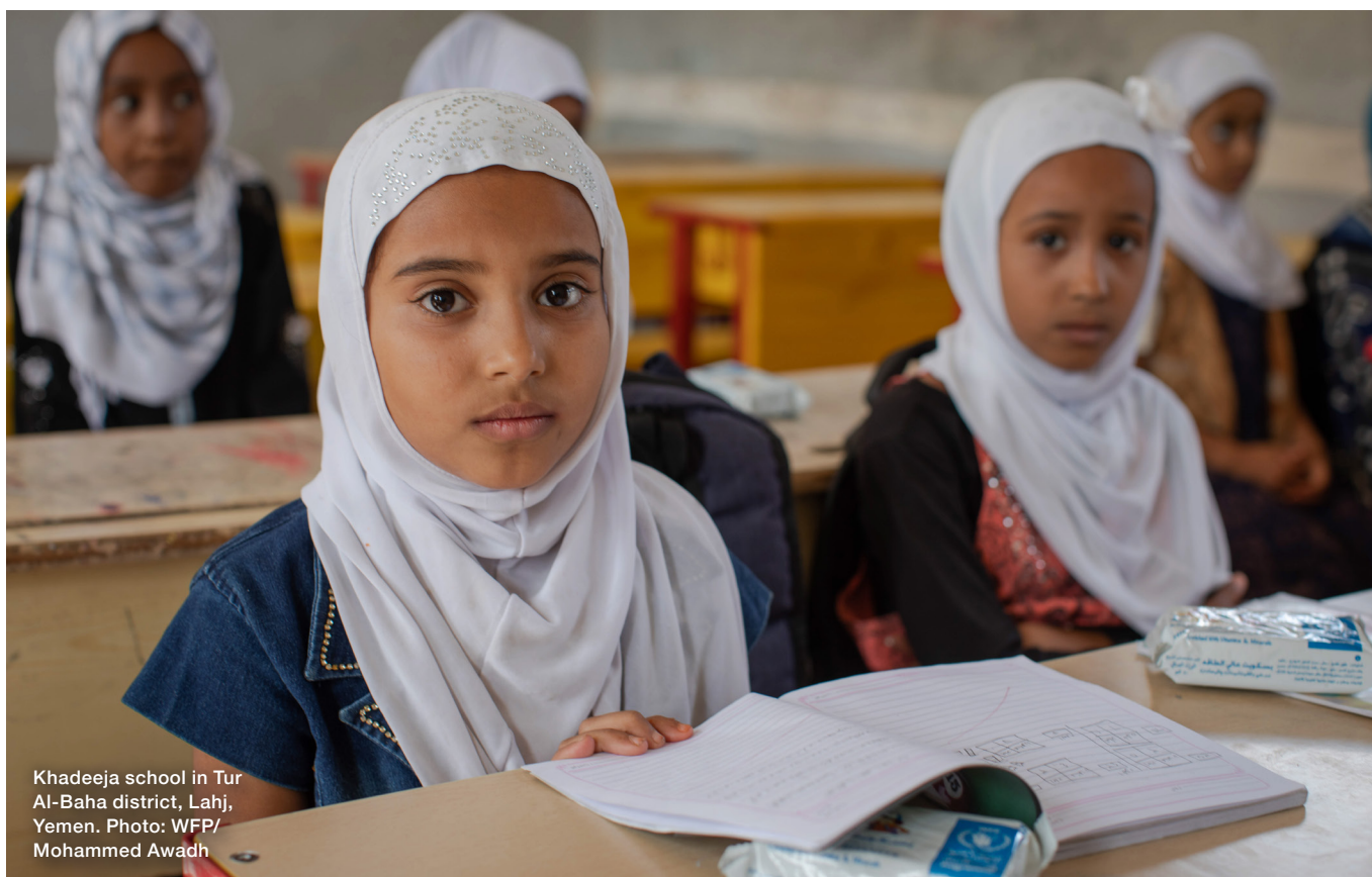
Khadeeja school in Tur Al-Baha district, Lahj, Yemen.