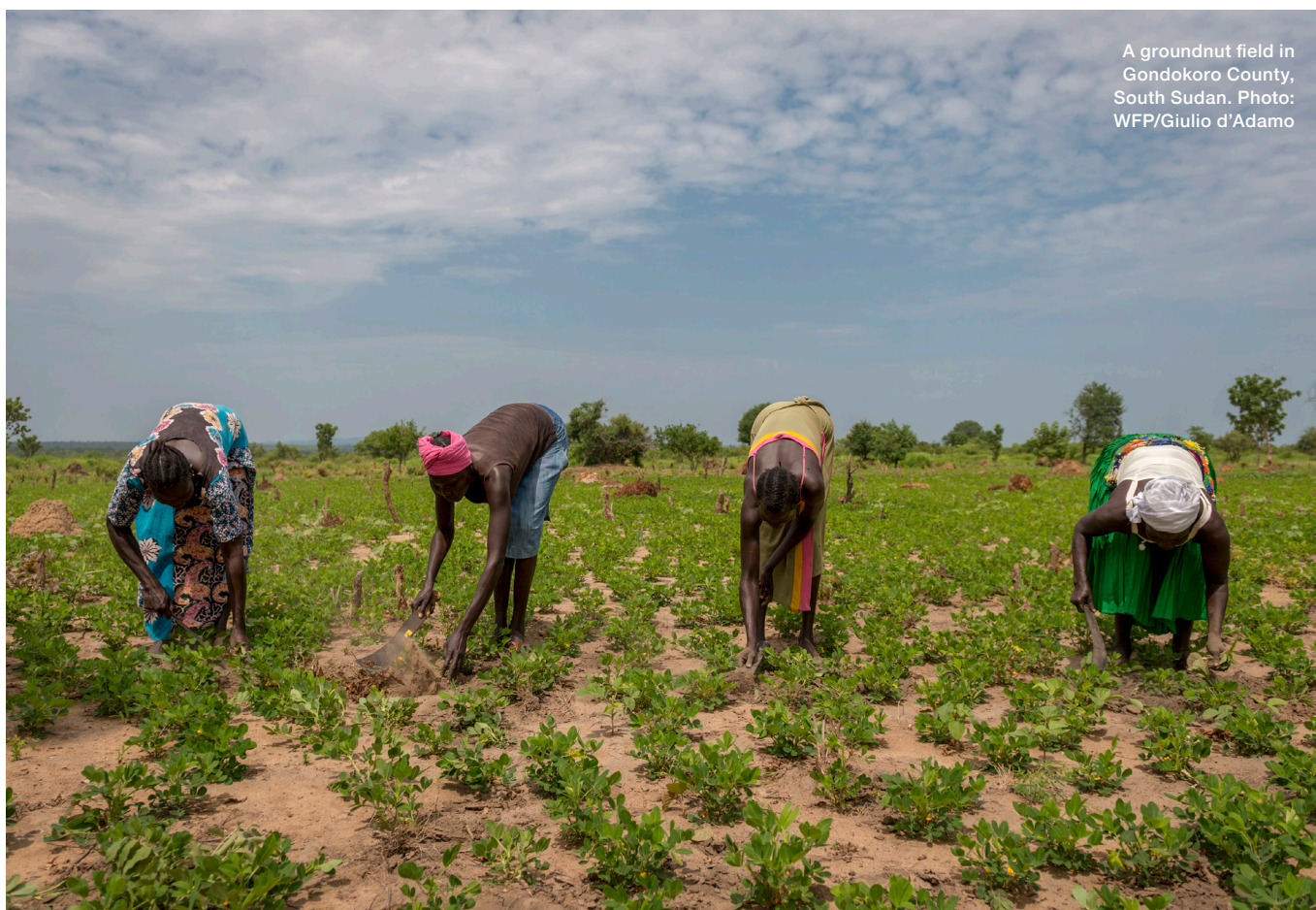
A groundnut field in Gondokoro County, South Sudan.