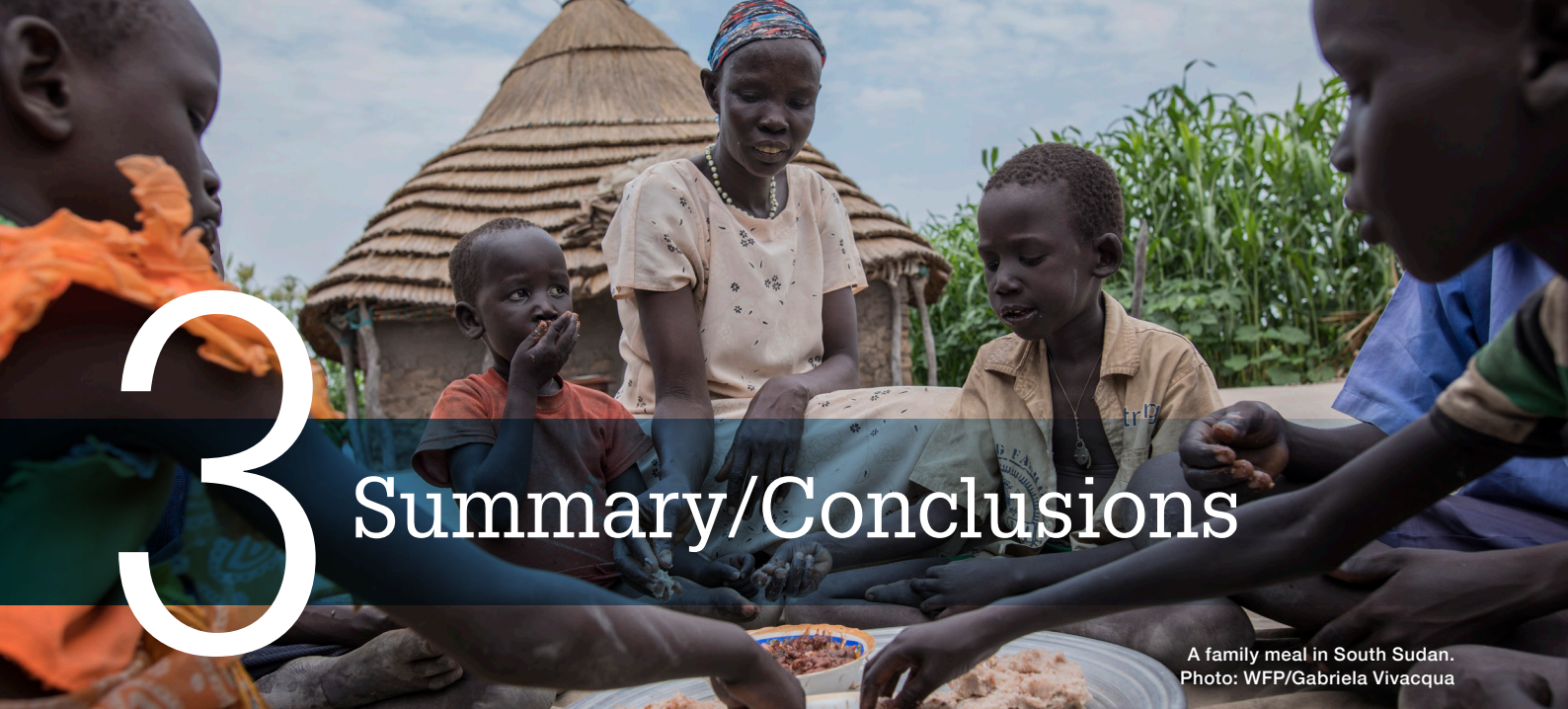
A family meal in South Sudan.