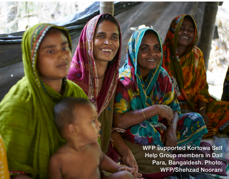
WFP Supported Kortowa Self Help Group members in Dail Para, Bangladesh.

in terms of strengthening local government capacity to mobilise resources and manage the MSNP through annual district FNS plans and budgets supporting village-level FNS plans (5). Districts and village-level MSNP committees need to take responsibility for all activities and focus on local governance and community capacity-building, developing annual plans and budgets for activities across sectors, increasing buy-in from other sectors, and expanding their involvement (5).