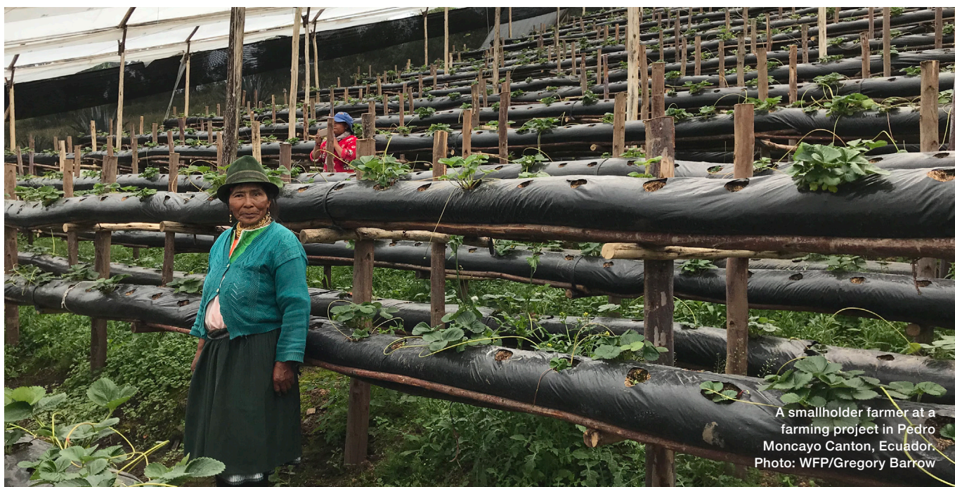
A smallholder farmer at a farming project in Pedro Moncayo Canton, Ecuador.

some services over others, can hinder improvements in coordination and service delivery of a broader range of nutrition interventions (32). A more integrated approach to coordination meetings would allow for delivery of a combination of nutrition-related services to the mother-child dyad in the first 1,000 days (32).