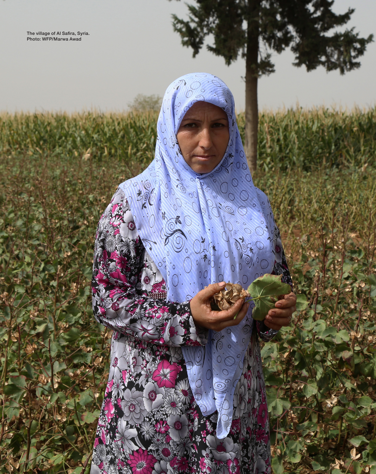
The village of Al Safira, Syria.