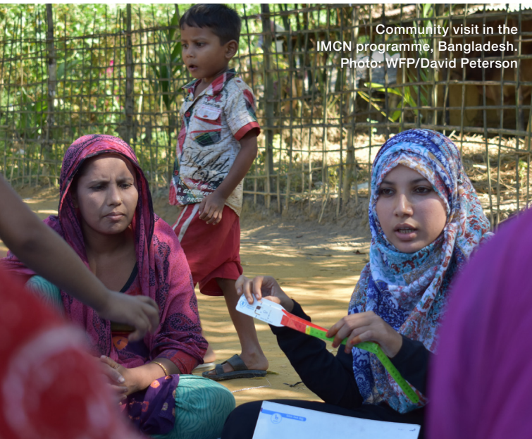
Community visit in the IMCN programme, Bangladesh.

Mejia-Acosta et al (11) emphasise the importance of common recognition of the seriousness of malnutrition by all country actors at all levels and inclusion of nutrition as a core indicator of development; strongly associated with poverty reduction (11). This facilitates an understanding of nutrition as a broader issue than just health (12). Levinson et al (13) describe the benefits of communication of a country multi-sector nutrition strategy at different levels. District staff are often unaware of initiatives and agreements made at central level and need to understand how an overarching, collaborative strategy relates to and benefits their work if they are to work effectively together (13).