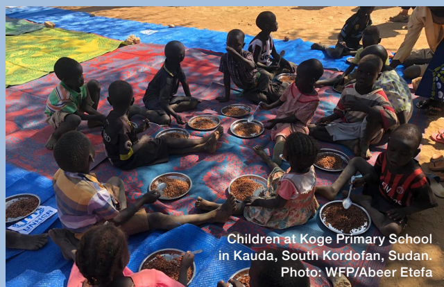
Children at Koge Primary School in Kauda, South Kordofan, Sudan.

and Nutrition Programme and to resolve the challenge of multiple information systems at district level (48). The system collects data from key government sectors (including health, agriculture, education and gender) and implementing partners and converts the information for use in planning and evidence-based decision-making at both district and national level (48). The operationalisation of this system involved: the identification of bottlenecks to effective M&E at district level for data collection, processing, reporting and usage; harmonisation of existing sector nutrition indicators and alignment to SDGs and their inclusion in data collection tools, including registers and report formats; the development of a multi-sector nutrition information system and advocacy on the use of information at district level; capacity-building of district M&E teams from all key sectors in data collection, data quality and data analysis; development and dissemination of standard operating procedures with a dashboard link to form charts, graphs and reports; rollout and follow-up (48). The integration of this system into the national Food Security and Nutrition Plan ensures that information generated is disseminated and used by partners; this facilitates capacity-building of government and implementing partners (48).