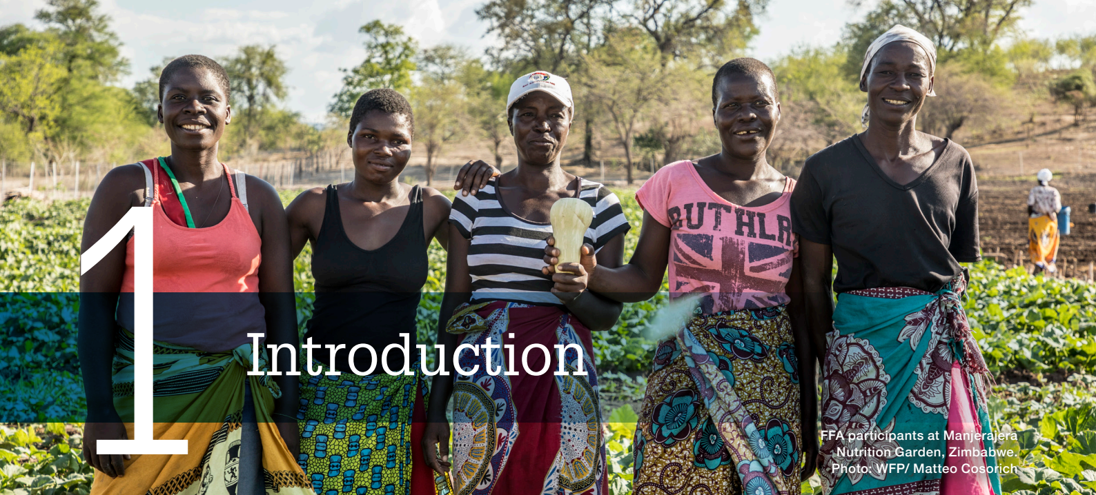
FFA participants at Manjerajera Nutrition Garden, Zimbabwe.