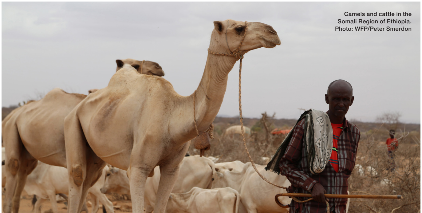
Camels and cattle in the Somali Region of Ethiopia.

A ‘trickle down’ approach to cascade training down to district level in Tanzania (20) involved training a group of dedicated facilitators to lead participatory workshops on multi-sector nutrition; then further layers of regional and district officials and sector staff were trained in planning and budgeting (20). This was considered to have greatly contributed to raising the profile of nutrition in regions and districts, convincing decision-makers to integrate priority nutrition interventions into sector plans and budgets and to set up nutrition steering committees at the district level (20).