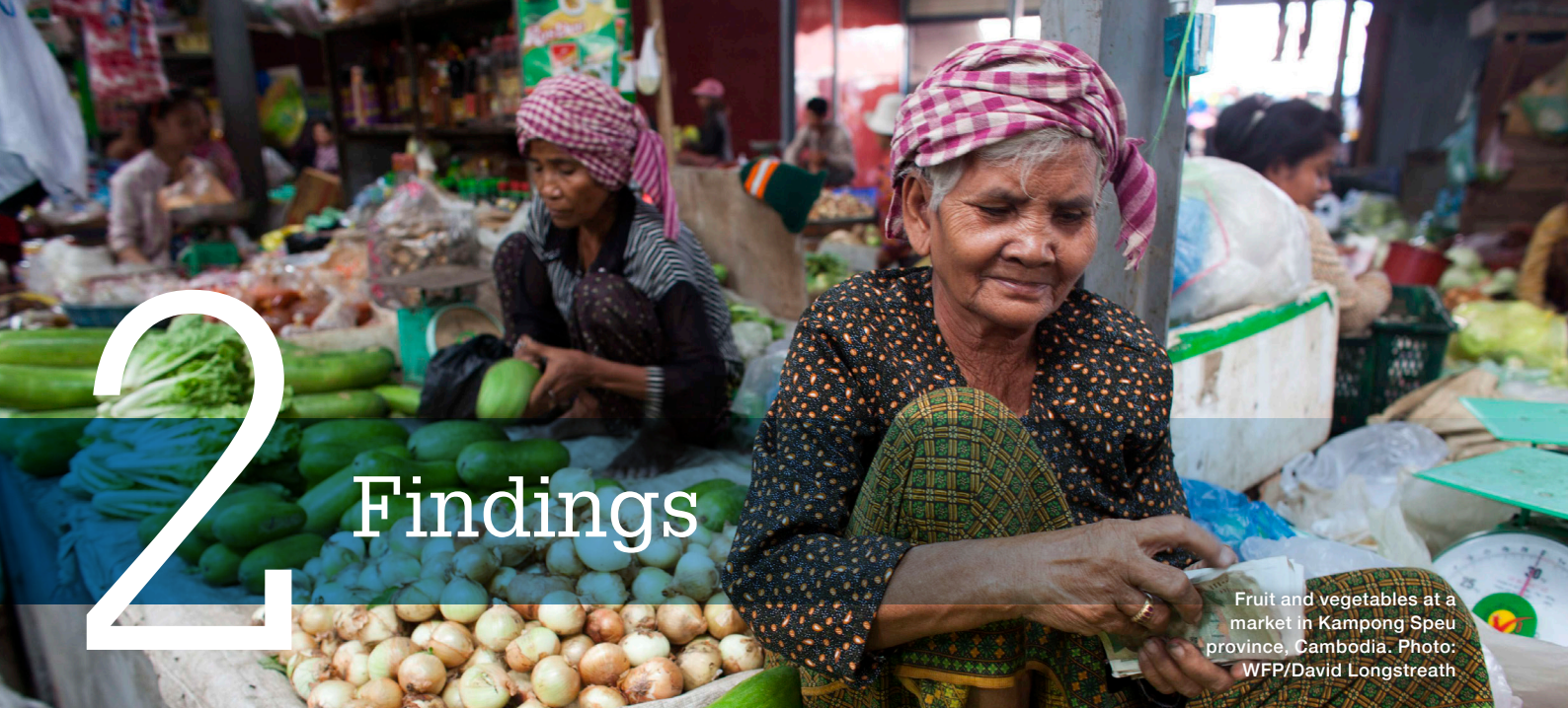
Fruit and vegetables at a market in Kampong Speu province, Cambodia.