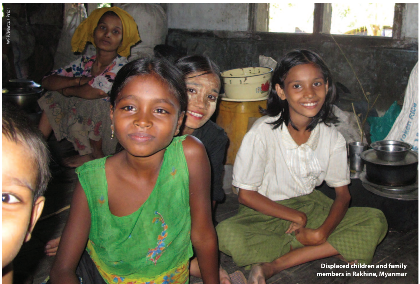
Displaced children and family members in Rakhine, Myanmar