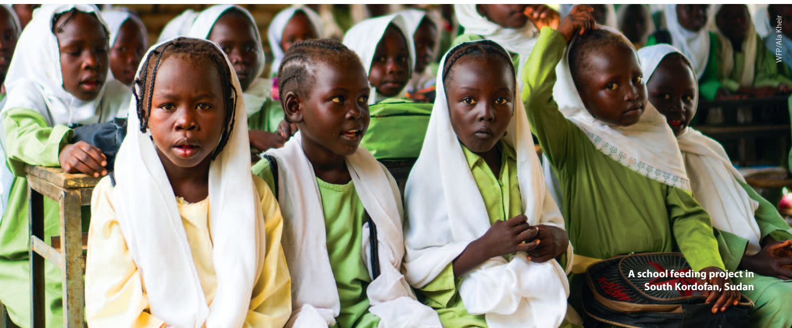
A school feeding project in South Kordofan, Sudan

In some countries where it is active, the UNN plays an important role 'behind the scenes' at country level, influencing government, funding, coordination and activities, and establishing an enabling environment for other SUN structures to emerge. The role of the UNN behind the scenes is important in FCAS, where the funding and technical support of the UNN is often needed to support governments. In Sudan, each UN agency involved in the UNN is supporting one of the other SUN Networks to get off the ground through financial, technical and coordination support. The UN agencies in Sudan have even formalised their role of supporting the SUN Networks by having this activity included in individual ToRs for UN staff. The WHO is supporting the CSN to become established and apply for MPTF funding, WFP is supporting the set-up of an SBN, and UNICEF (UNN