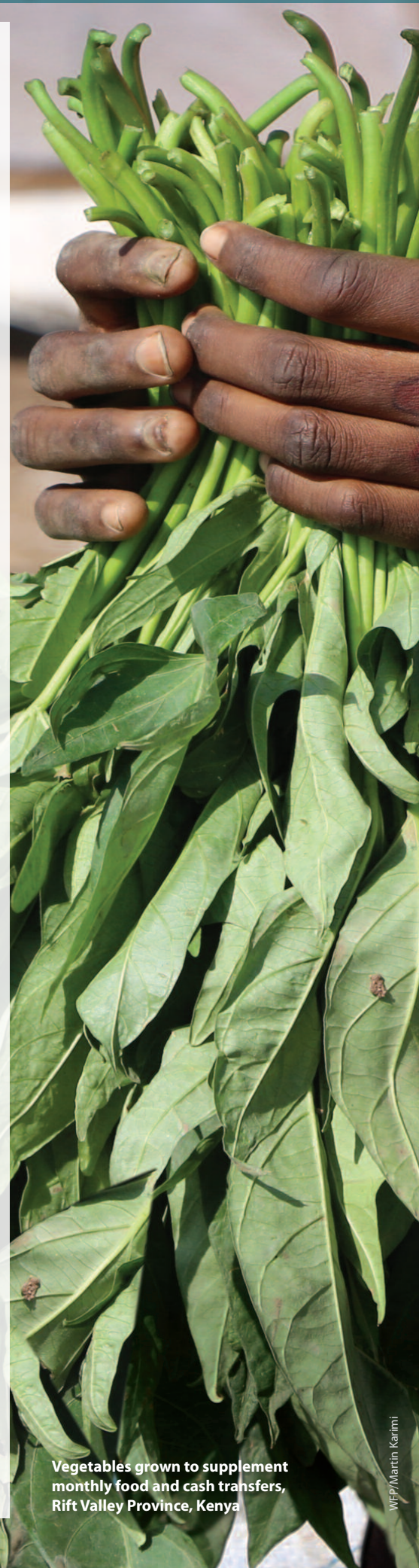
Vegetables grown to supplement monthly food and cash transfers, Rift Valley Province, Kenya