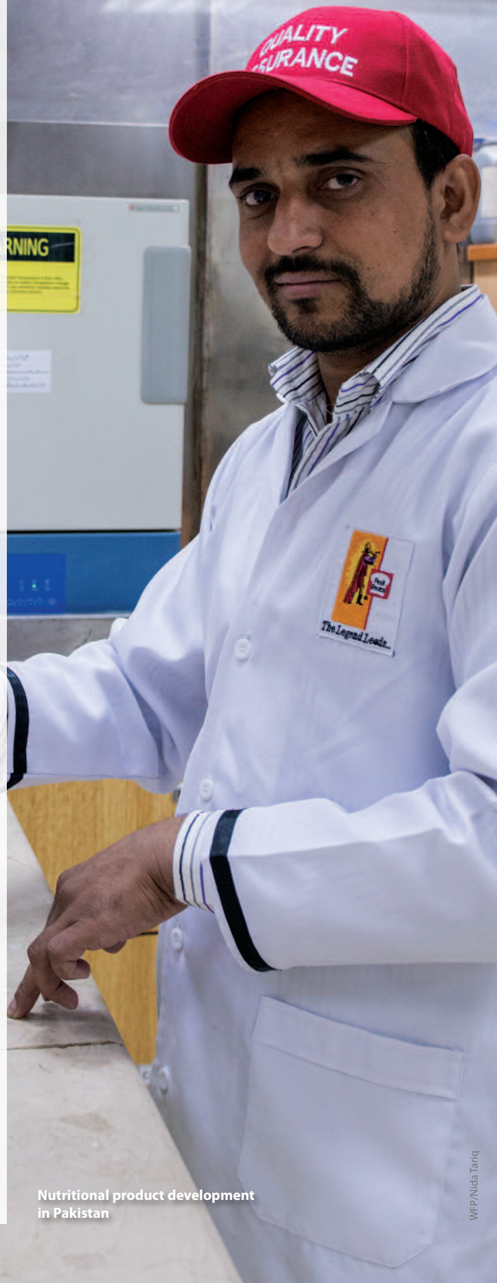
Nutritional product development in Pakistan