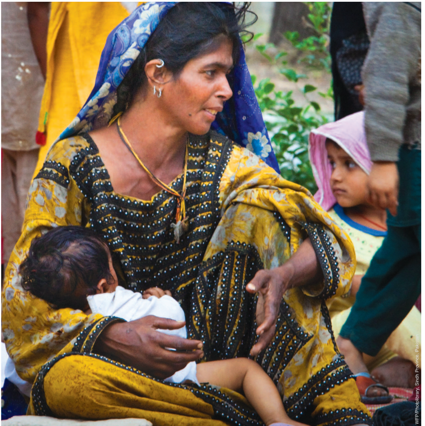
Sindh Province, Pakistan