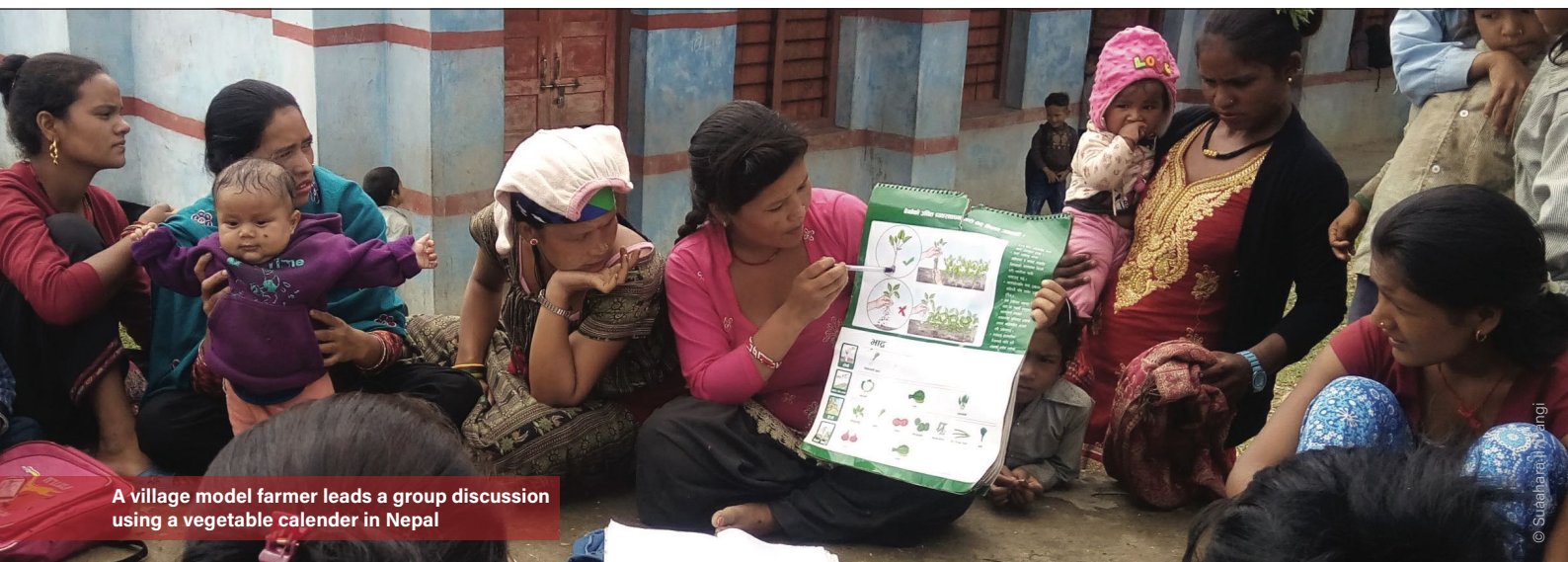
A village model farmer leads a group discussion using a vegetable calendar in Nepal