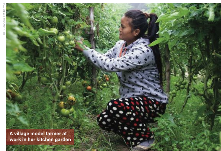
A village model farmer at work in her kitchen garden

In the VMF EHFP-led groups, monthly meetings are used to talk about challenges and learnings related to agriculture and poultry rearing, as well as to encourage adoption of essential household health, nutrition and WASH behaviours; particularly food-intake behaviour, including improving child and maternal dietary diversity. VMFs not only discuss how to grow nutrient-dense vegetables and produce eggs but also how to make nutritious recipes; for example, by using pumpkin and egg in rice porridge, to reinforce the 'garden-to-plate' approach. VMFs also promote optimal complementary feeding practices, including timely introduction of complementary foods and how to make best use of locally available, diverse, nutritious foods for infants, starting at six months of age. Other strategies to improve awareness on increasing