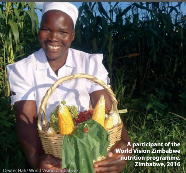
A participant of the World Vision Zimbabwe nutrition programme, Zimbabwe, 2016