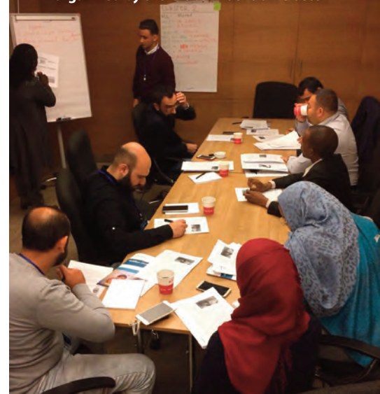
Participants of the Nutrition Cluster Coordination Training held in Istanbul, Turkey organized by the Global Nutrition Cluster

operating procedures (SOPs) for the targeted distribution of BMS.