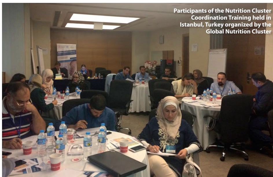
Participants of the Nutrition Cluster Coordination Training held in Istanbul, Turkey organized by the Global Nutrition Cluster