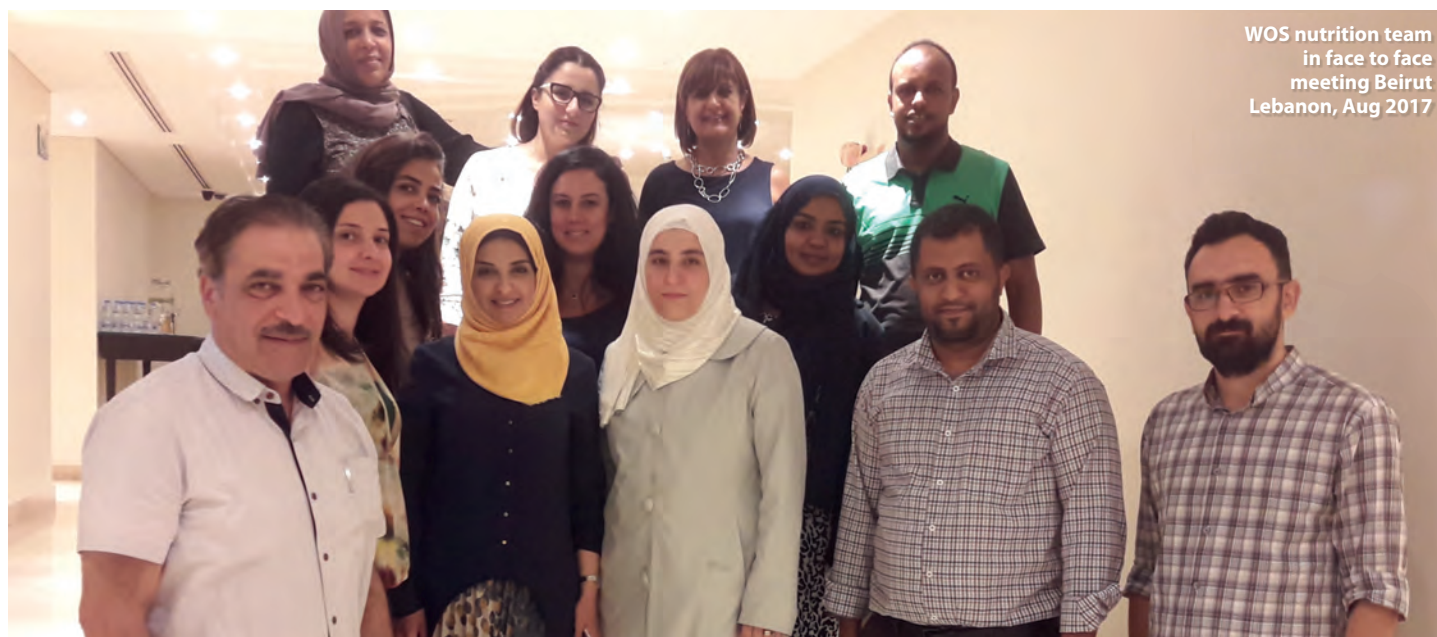
WOS nutrition team in face to face meeting Beirut Lebanon, Aug 2017